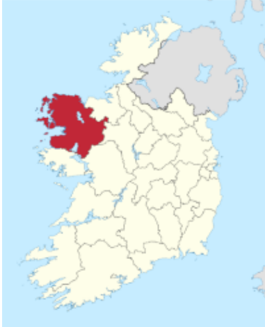
Ireland, County Mayo highlighted